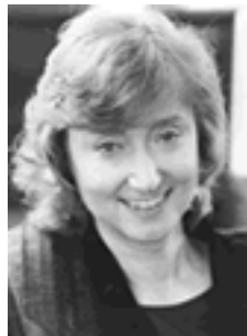
Deborah Tannen , bestselling author and University Professor, Georgetown University